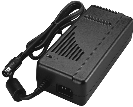
7.7"W x 3.46"L x2.0"H