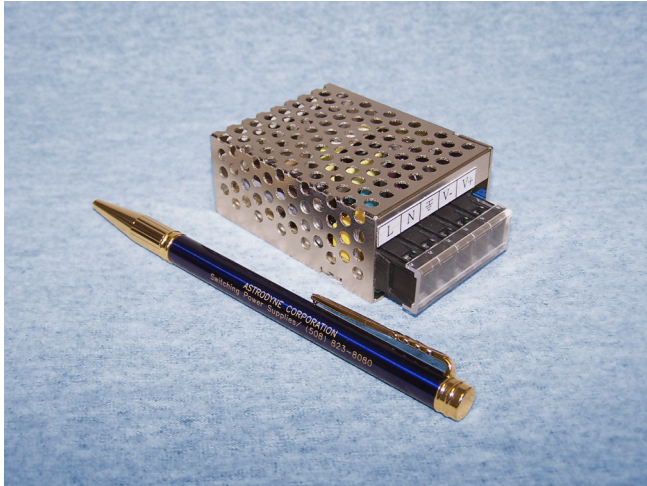
2.59"W x 1.98"L x 1.1"H