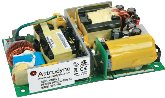
3" x 5" x 1.28"