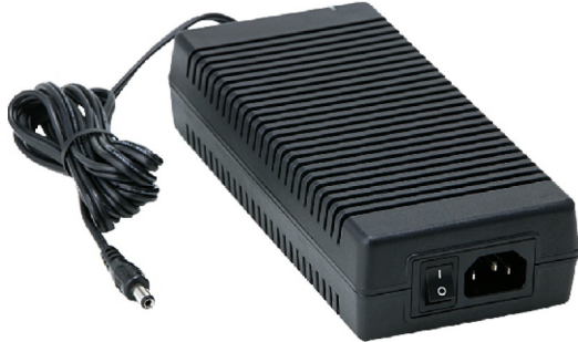
3.52"W x 7.44"L x 1.79"H